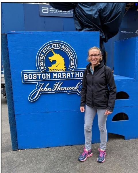
2019 Boston Marathon

She graduated from Canton High School in 1992 with a multitude of records and state titles. She still holds 13 Canton school records in addition to winning 14 state meet medals – ten in track and four in cross country. She came oh, so close to winning four consecutive state cross country titles, a